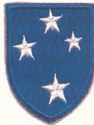
Americal Infantry Division