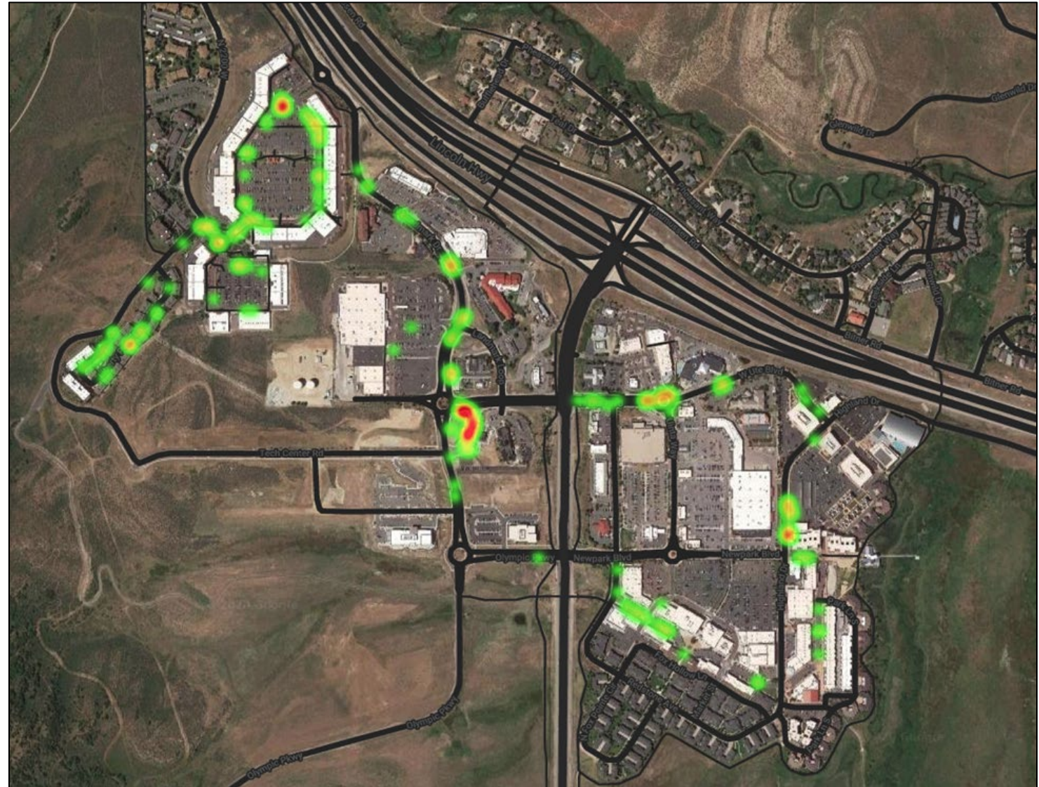
Kimball Junction Circulator ridership